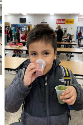
Tie Tuesday & Pearl Wednesday